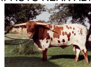
IMPACTS REAR ADMIRAL