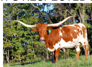
HUNT'S RESPECTED DIANNE