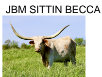
JBM SITTIN BECCA