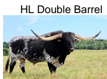
HL Double Barrel