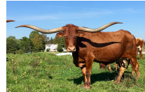
HUBBELLS RIO GLORY