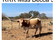
RRR Miss Becca 307