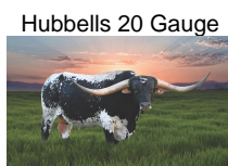
Hubbells 20 Gauge